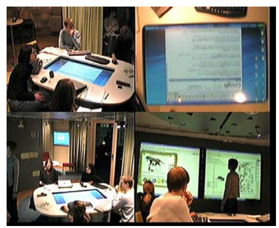
Figure 2. The view of the video recordings with four angles

Data were collected through observations, pre- and post-study questionnaires, and ended with semi structured group interviews. Both the work sessions and the interviews were video taped. The recordings consist of four angles to cover the whole workspace (see figure 2), and one channel for sound. Altogether the data material consists of 21, 5 hours of video data. As a tool for our analysis we have used interaction analysis (Jordan & Henderson, 1995), and more specifically, certain foci for analysis, namely spatial organization of activity, participation structures, artefacts and documents, turn-taking, and trouble and repair.