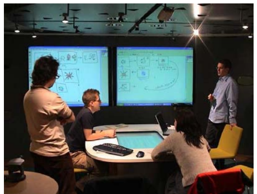
Figure 3. A group discussion regarding design sketches

The interactive screens were mainly used in two different ways. Mostly to present rudimentary sketches, often visual, to other team members as illustrated in figure 3. Individual sketches on paper sometimes preceded this. The other way to use the screens was to present web pages from the Internet, in order to discuss the information that was found, the design or other issues coupled to the project. In both cases the goal was to make information available to others in order to discuss (which makes it open for re-interpretation or disputing of the idea). In this way the team gets the "raw" information, rather than some pre-processed summary prepared by another team member.